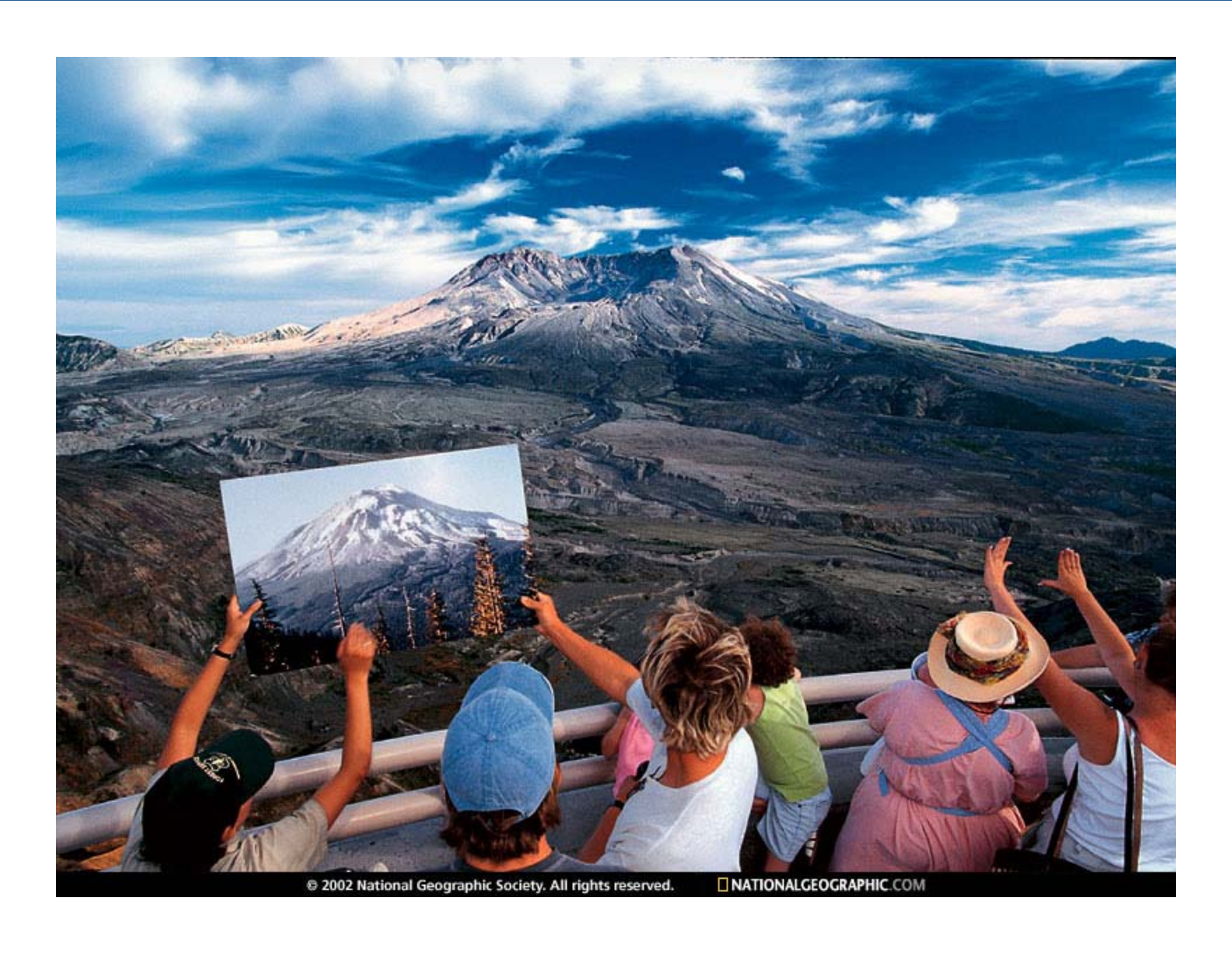
Community • Results • Leadership • Sustainability