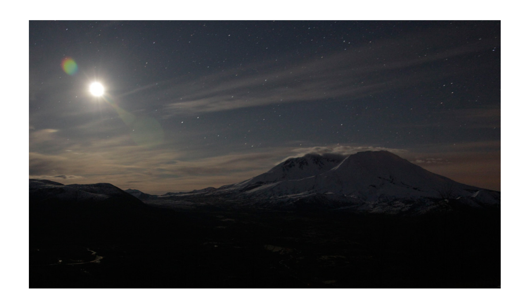
Community • Results • Leadership • Sustainability