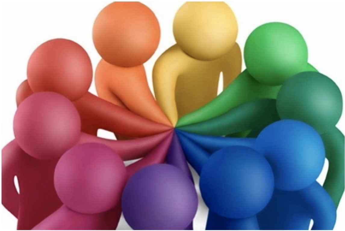
Understanding the process