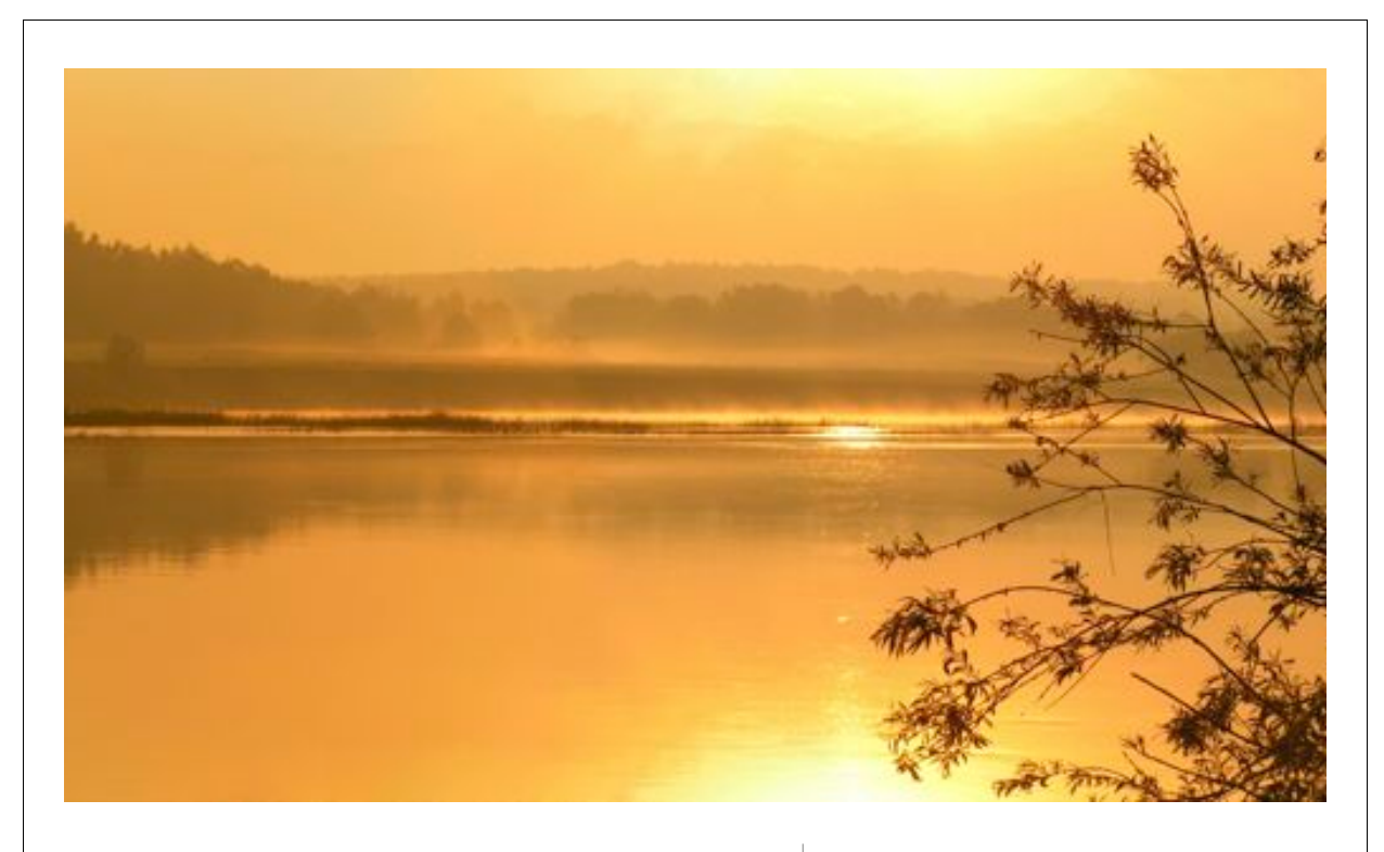
BHRS Alcohol and Other Drug Stakeholder Process

Luminescence Consulting 310 422 2256 • luminescence.org